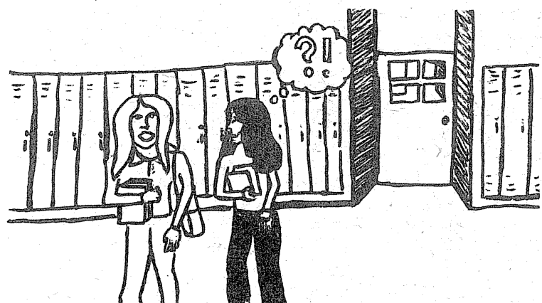
Say, is it true what I heard, that we're supposed to wear mini skirts during mini-mini week?